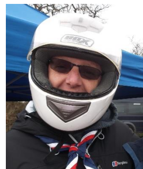
Me at Revo!

A £60 non-refundable deposit will be needed payable to Isle of Wight Scout Council or email me to BACS. Elaine Sharkey and I will be looking after you. More about the event at https://www.facebook.com/groups/iowrevolution/ See page 4 for a few more photos of Revo.